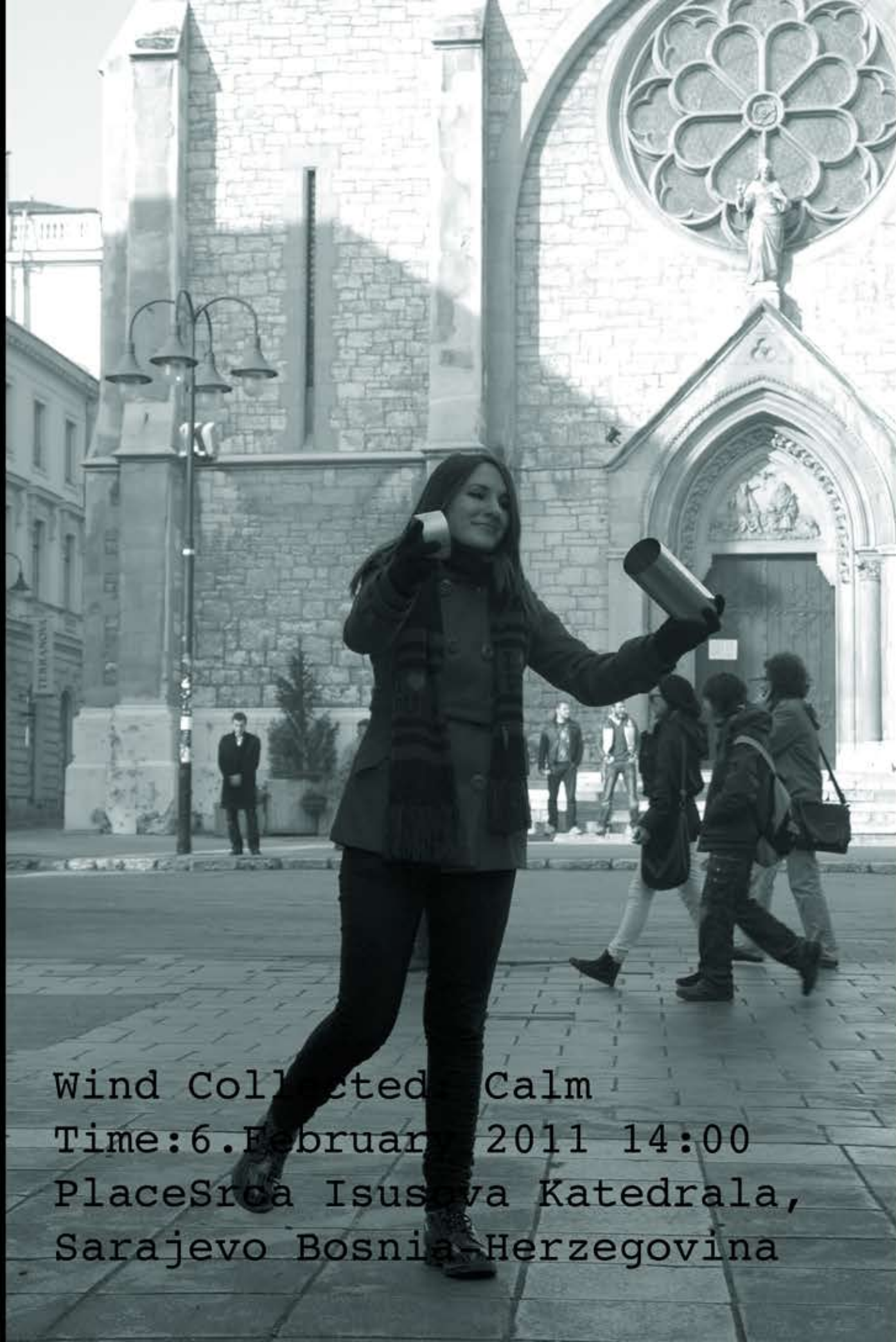
Wind Collected: Calm Time: 6. Februar 2011 14:00 Place: Srca Isusova Katedrala, Sarajevo Bosnia-Herzegovina