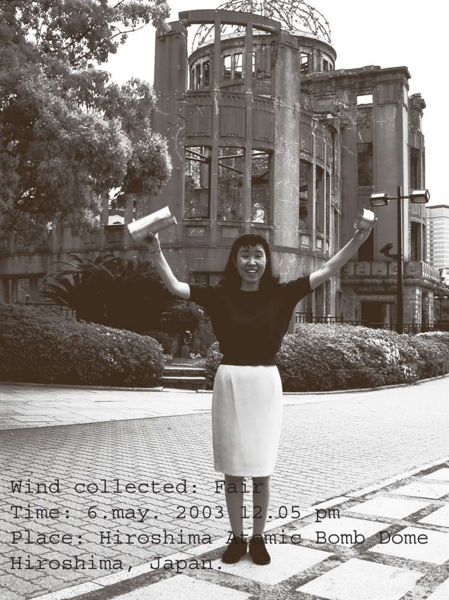
Wind collected: Fair Time: 6.may. 2003 12.05 pm Place: Hiroshima Atomic Bomb Dome Hiroshima, Japan.