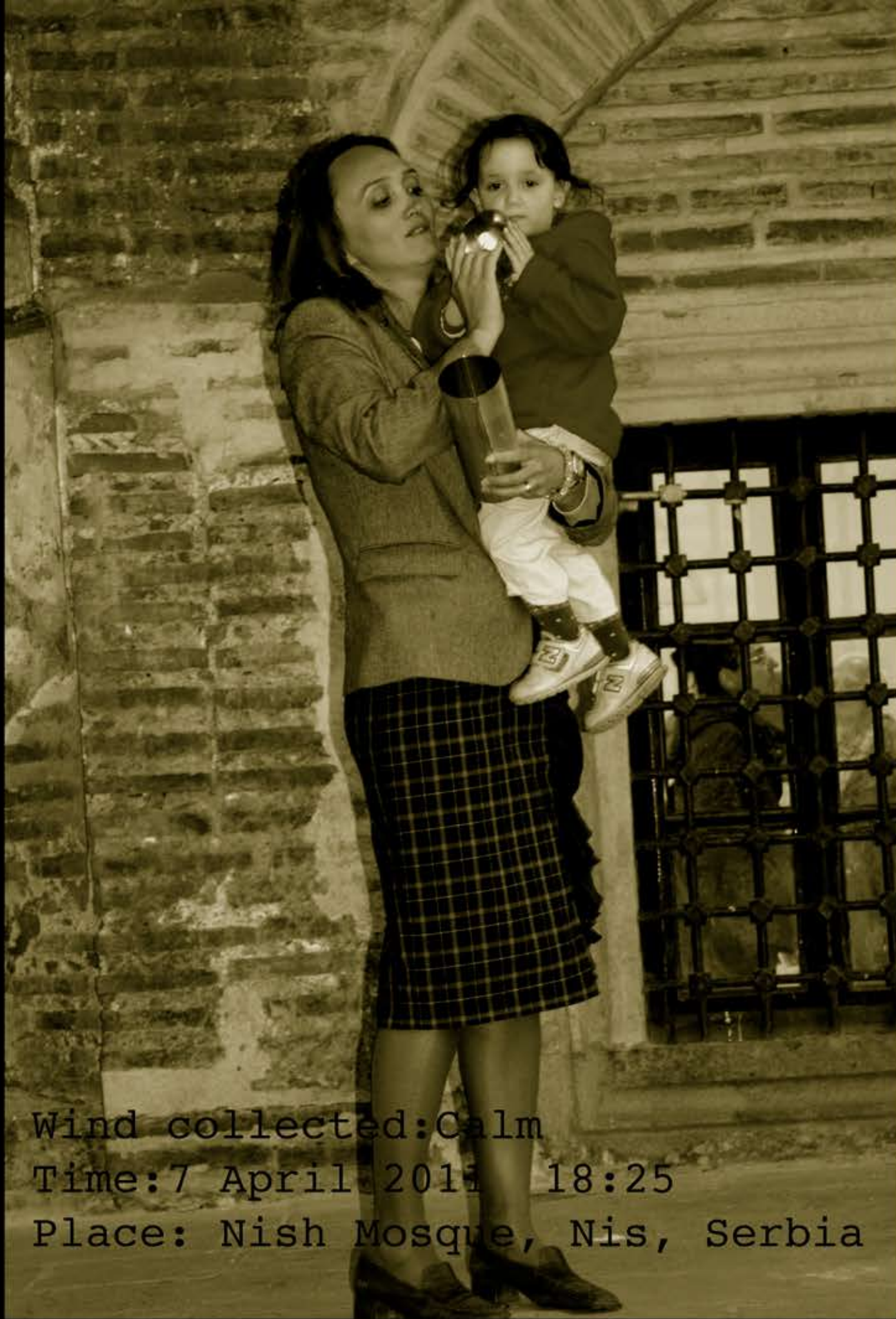
Wind collected: Calm Time: 7 April 2011 18:25 Place: Nish Mosque, Nis, Serbia