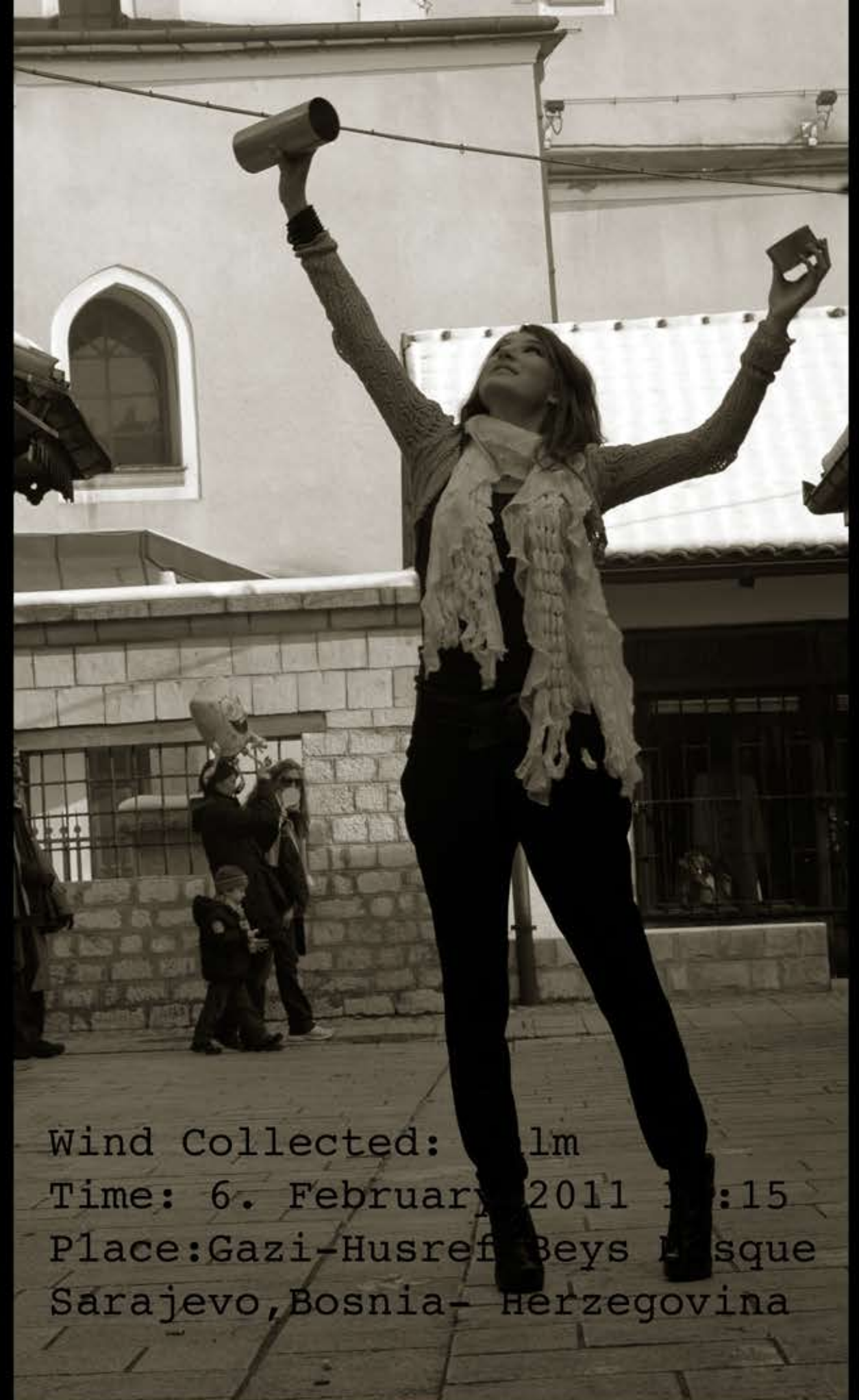
Wind Collected: Calm Time: 6. February 2011 19:15 Place: Gazi-Husref Beys Mosque Sarajevo, Bosnia-Herzegovina