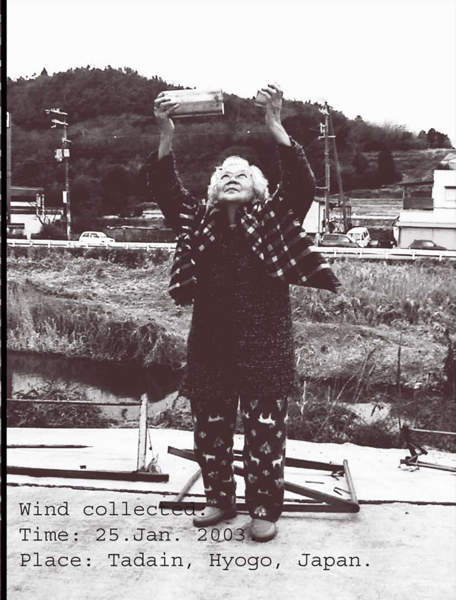
Wind collected. Time: 25.Jan. 2003 Place: Tadain, Hyogo, Japan.