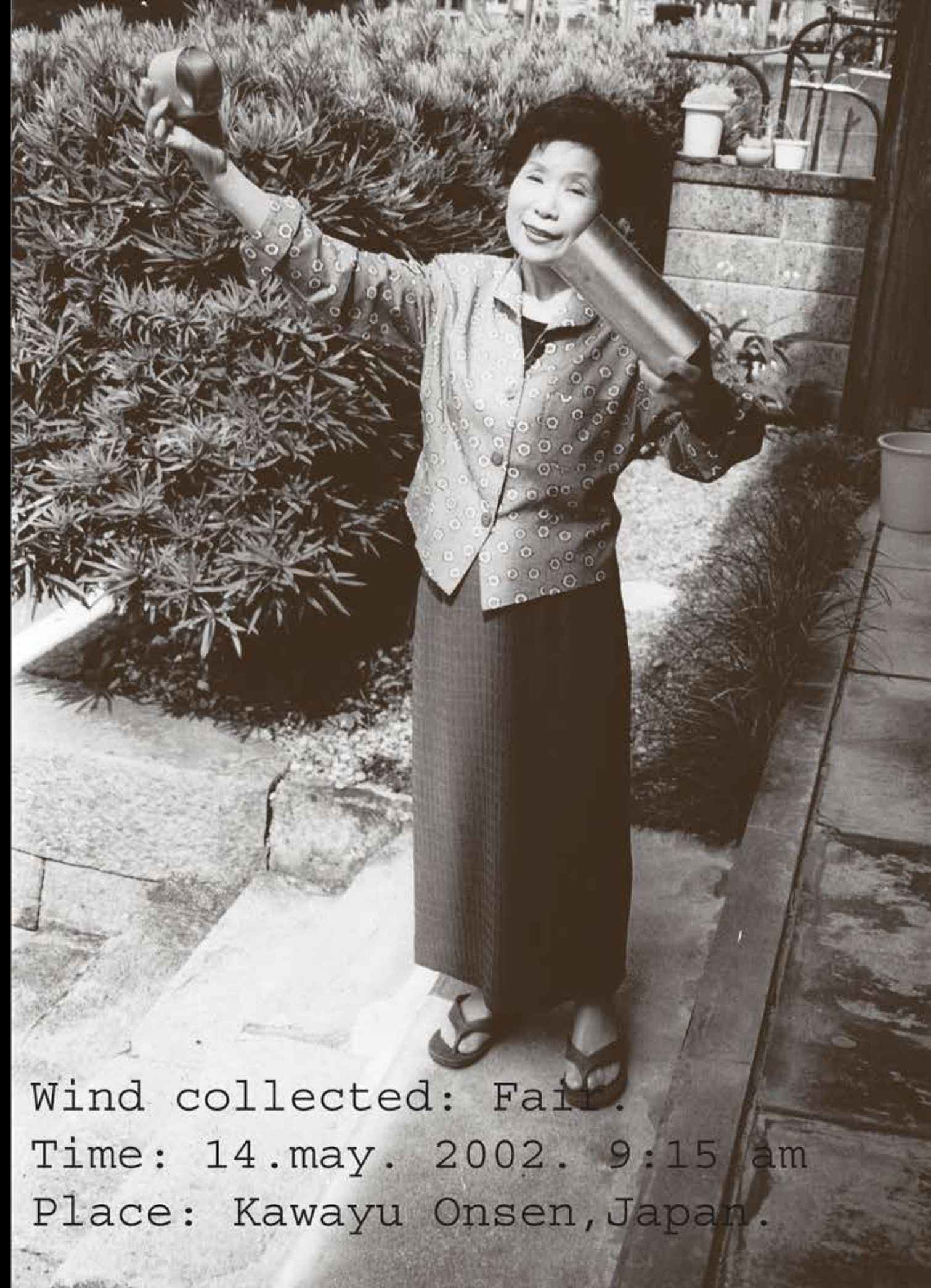
Wind collected: Fail. Time: 14.may. 2002. 9:15 am Place: Kawayu Onsen, Japan.