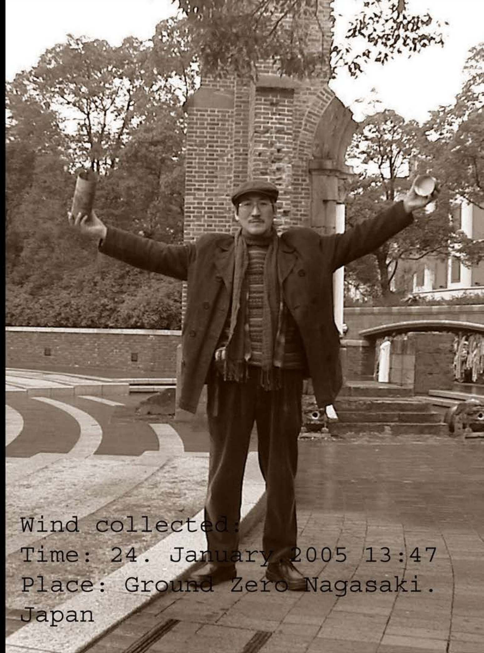
Wind collected: Time: 24. January 2005 13:47 Place: Ground Zero Nagasaki. Japan