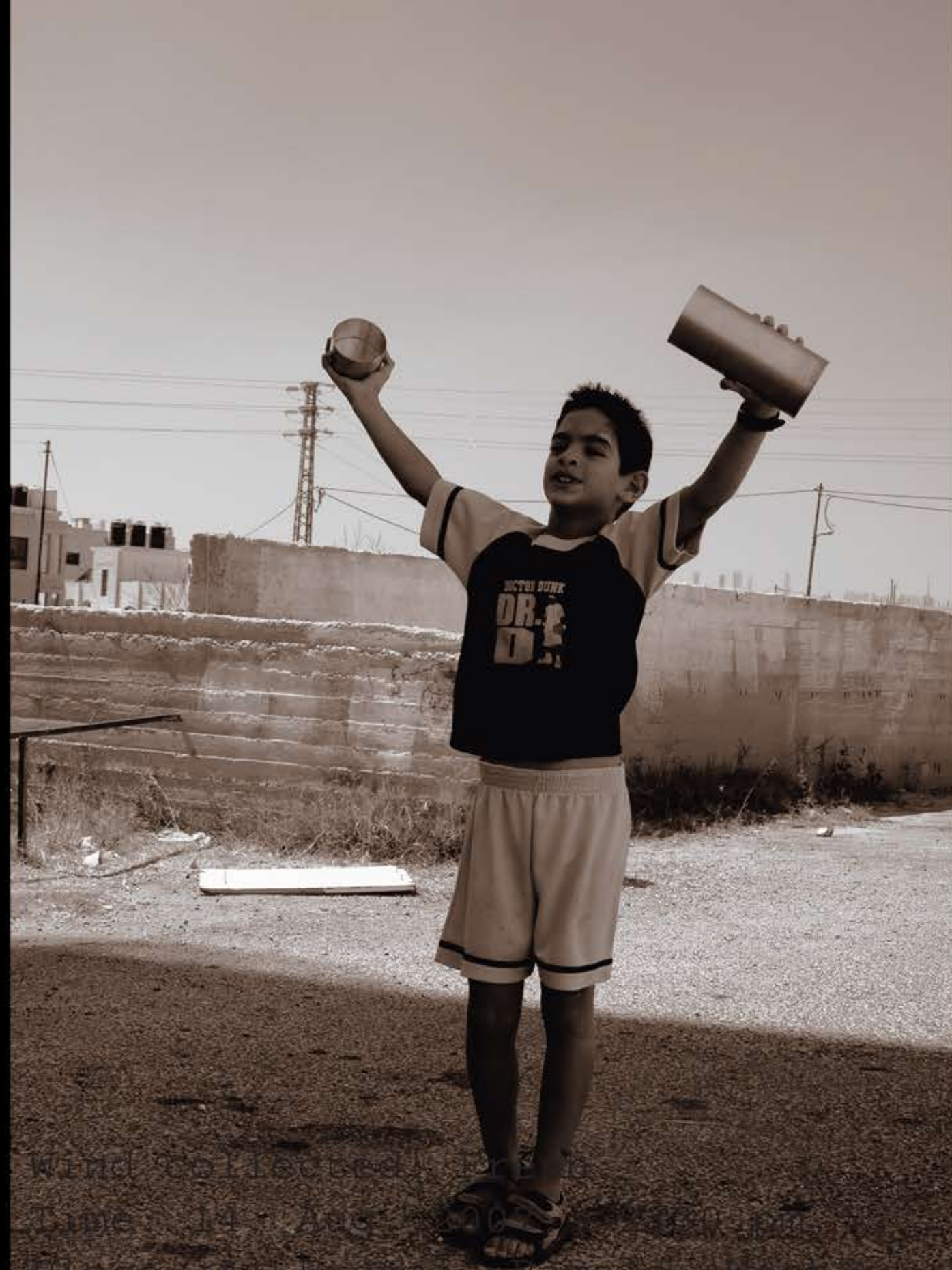
Wind collected: Calm Time: 14 Aug 2007, 0:47 pm Place: At Jerusalem, Israel Bank of Paper: 100