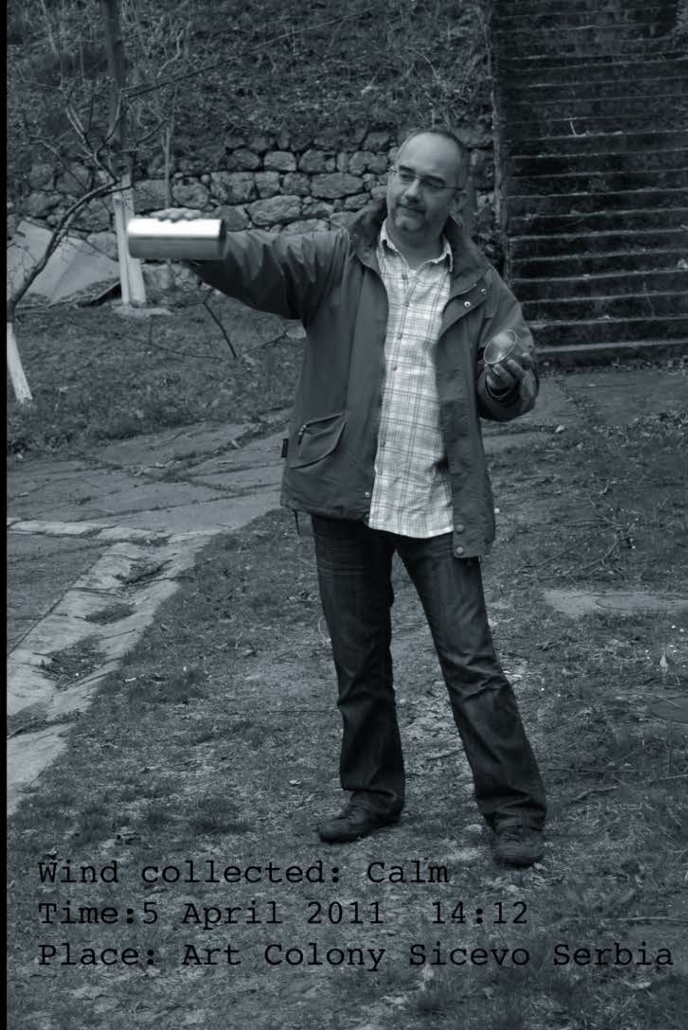
Wind collected: Calm Time: 5 April 2011 14:12 Place: Art Colony Sicevo Serbia