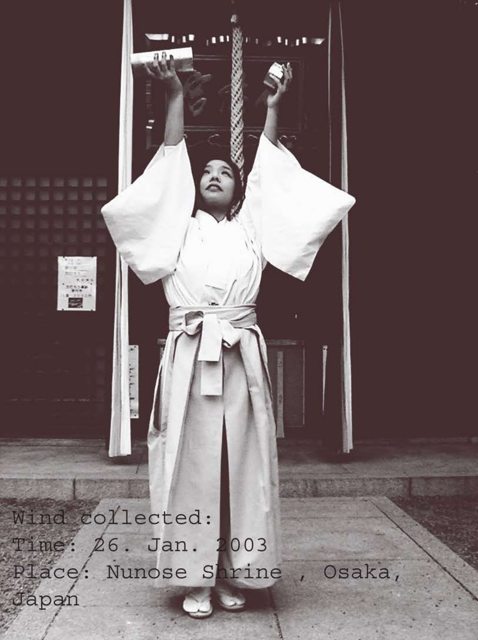
Wind collected: Time: 26. Jan. 2003 Place: Nunose Shrine , Osaka, Japan