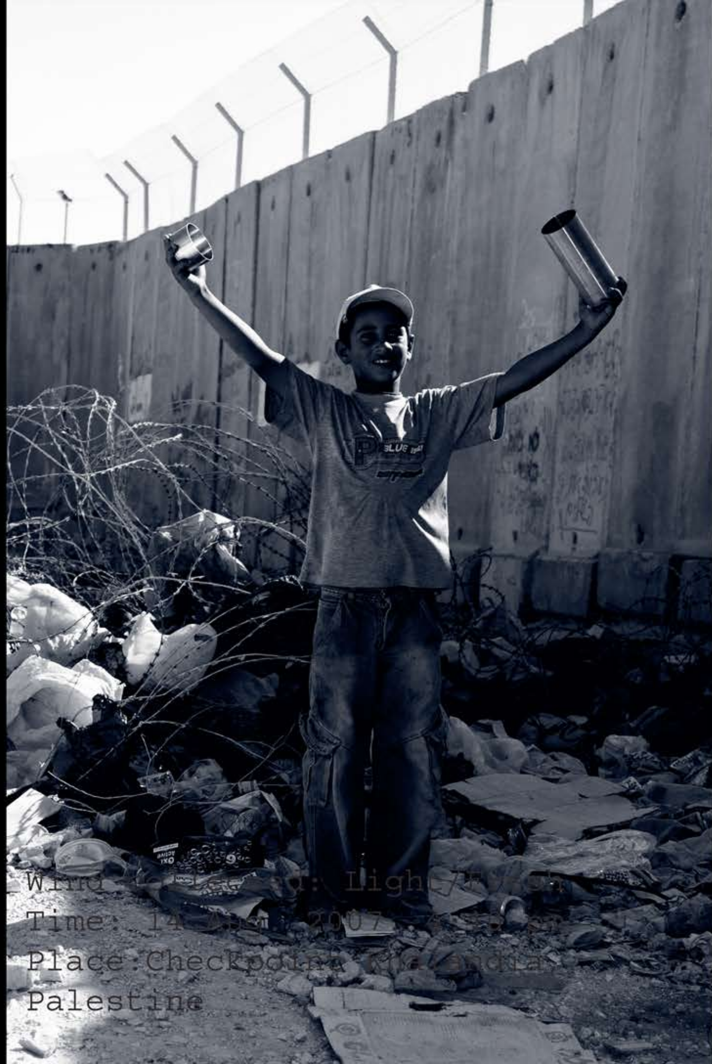
Wind : Light Time: 14 Aug , 2007 Place: Checkpoint No. 304 Palestine