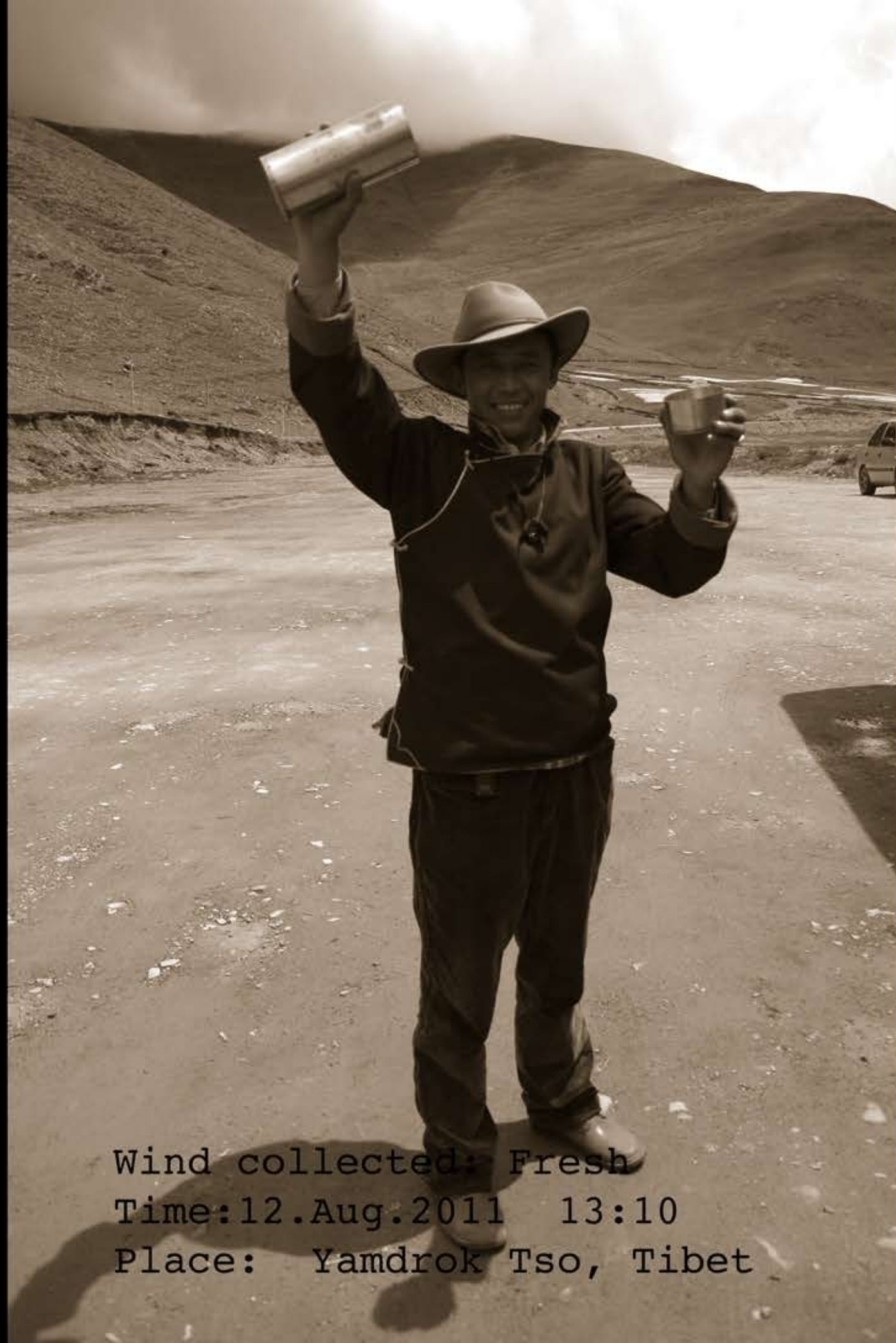
Wind collected: Fresh Time: 12. Aug. 2011 13:10 Place: Yamdrok Tso, Tibet