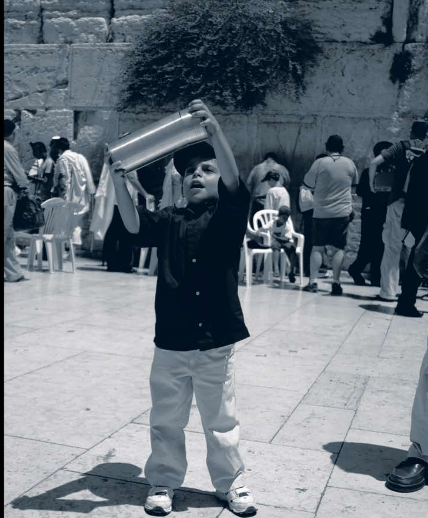
Wind collected: Calm Time: 13 Aug. 2007, 0:47 pm Place: Western Wall, Jerusalem, Israel