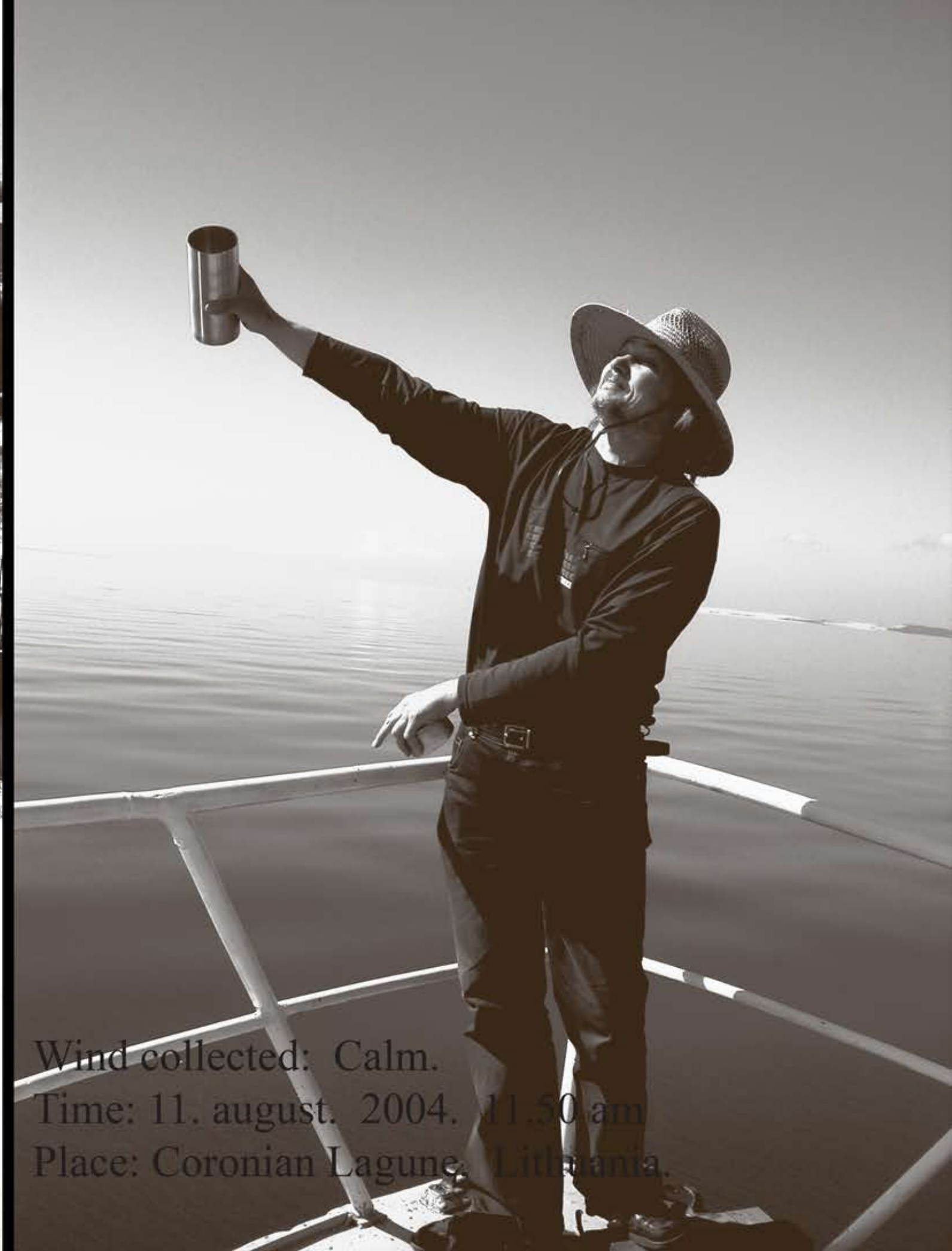
Wind collected: Calm. Time: 11. august. 2004. 11.50 am Place: Coronian Lagune, Lithuania.