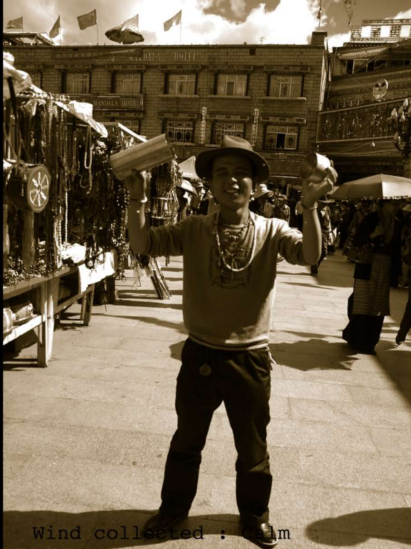
Wind collected : Calm Time:11. August 2011 16:55 Place: Jo Kang, Lhasa, Tibet