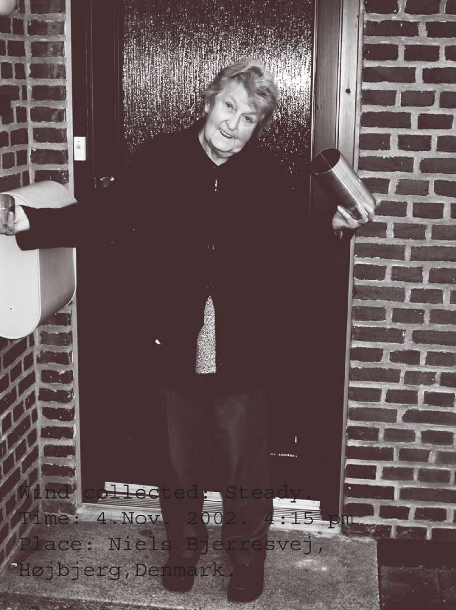
Wind collected: Steady Time: 4.Nov. 2002. 4:15 pm Place: Niels Bjerresvej, Højbjerg, Denmark.