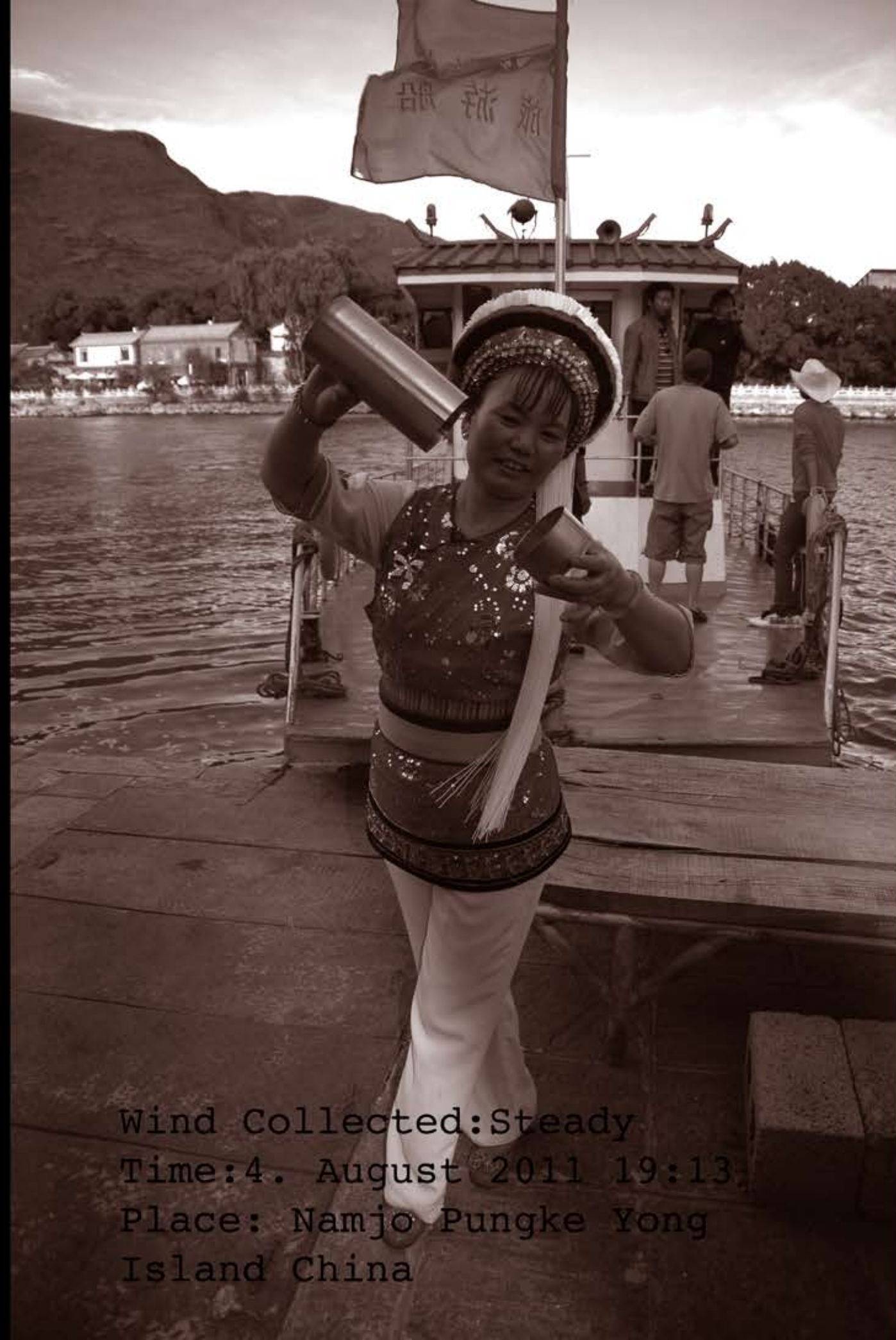
Wind Collected: Steady Time: 4. August 2011 19:13 Place: Namjo Pungke Yong Island China