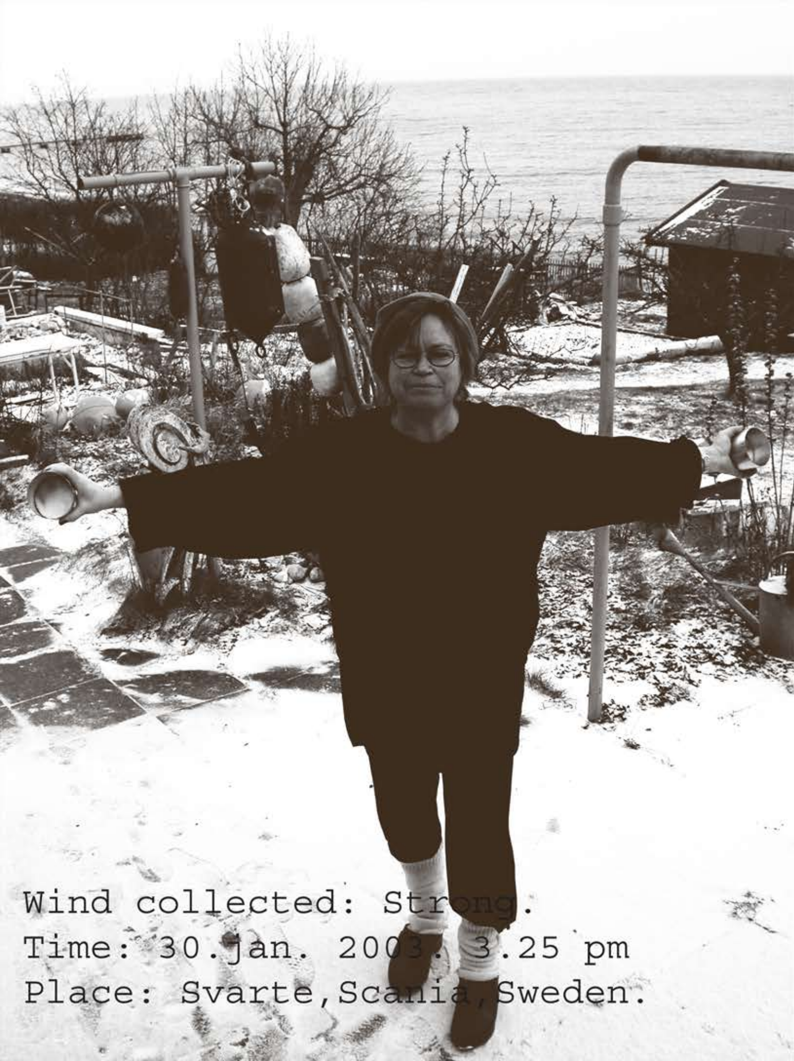
Wind collected: Strong. Time: 30. jan. 2003. 3.25 pm Place: Svarte, Scania, Sweden.