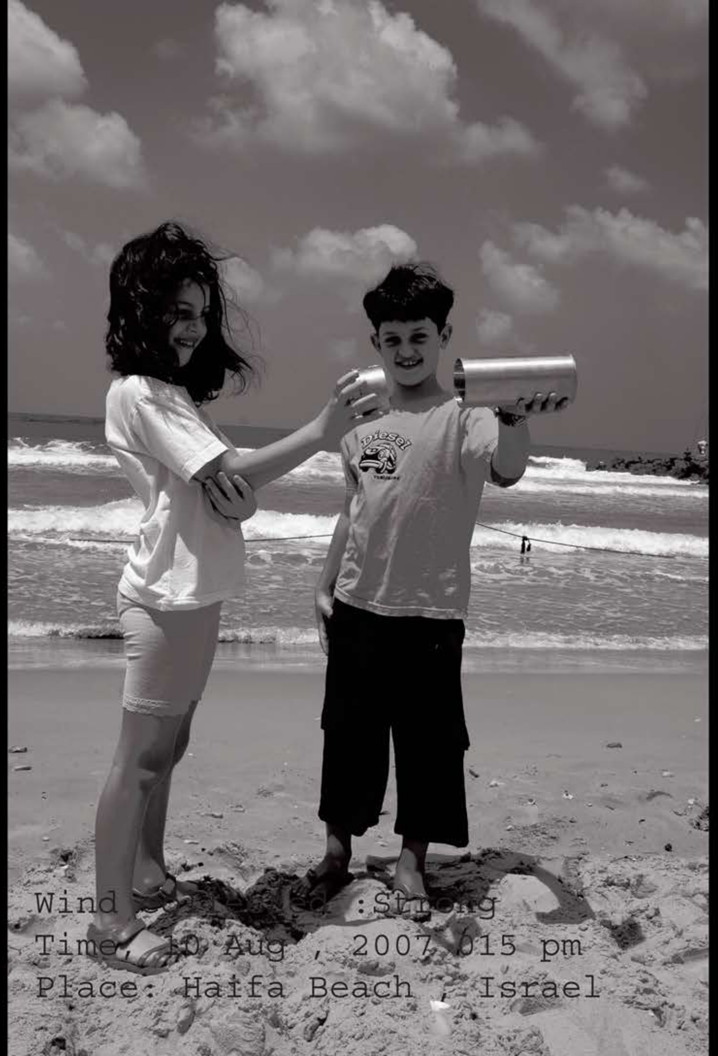
Wind : Strong Time: 10 Aug , 2007 015 pm Place: Haifa Beach , Israel